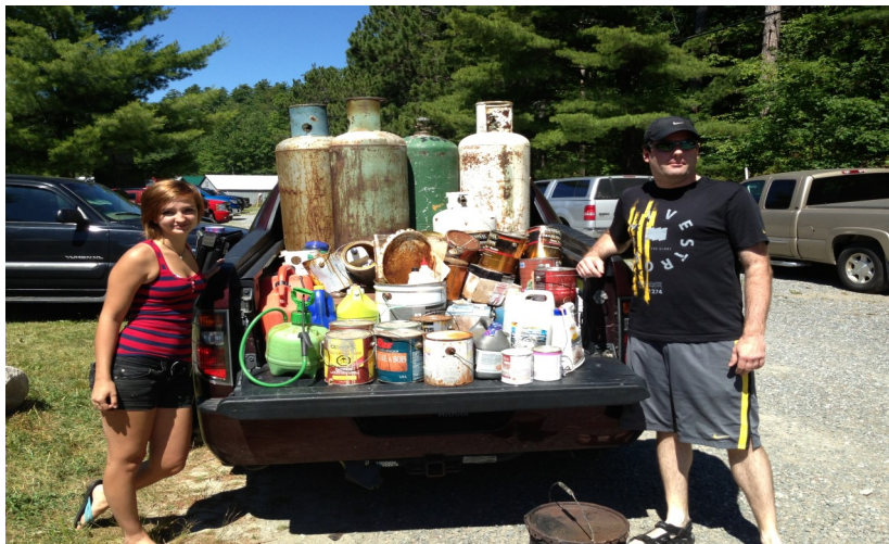
Household Hazardous Waste Clean-up Day, July 7, 2013